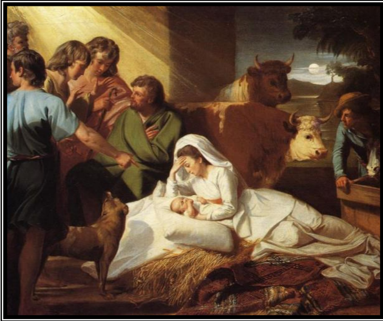
The Nativity , by John Singleton Copley 1776-1777 Oil on canvas