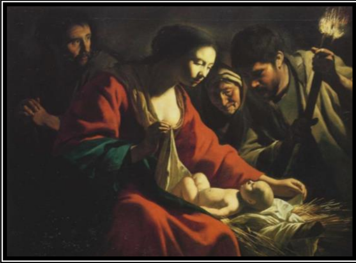
The Nativity, or The Nativity with the Torch , by the Le Nain brothers Oil on canvas Circa 17th century, France

FOURTH SUNDAY IN ADVENT DECEMBER 22, 2013